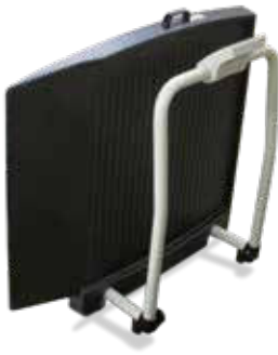
Wheelchair scale in folded position