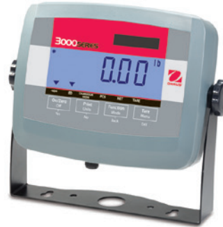
T31P Indicator shown with optional bracket