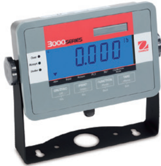
T32MC (LCD version)