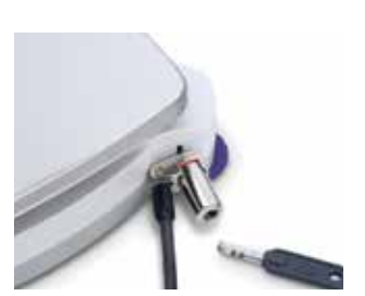
Security Slot Integrated security slot prevents theft